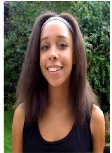
Eden // UK